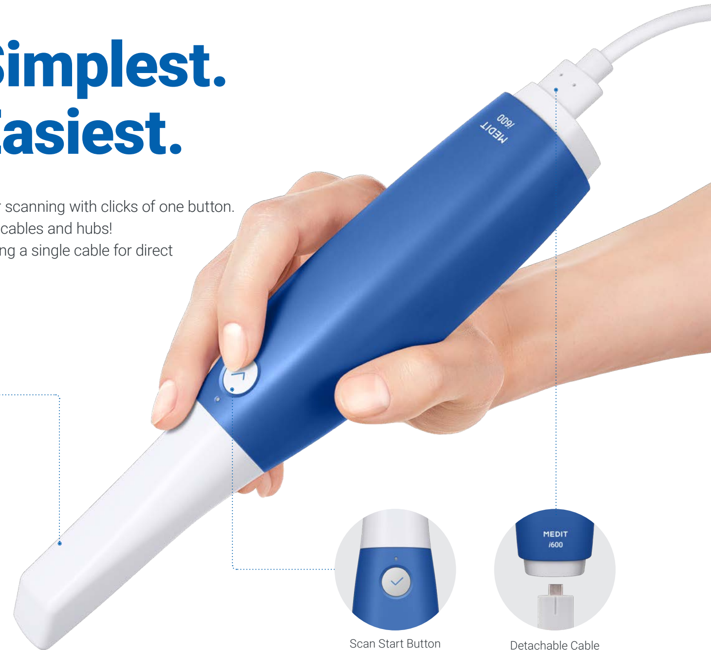
Scan Start Button