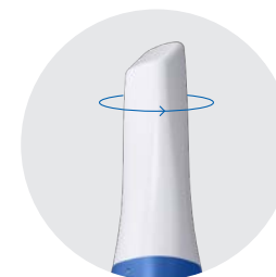
180° Reversible Tip

Take full control of your scanning with clicks of one button. No need for numerous cables and hubs! Simply Plug & Scan using a single cable for direct connection with a PC.